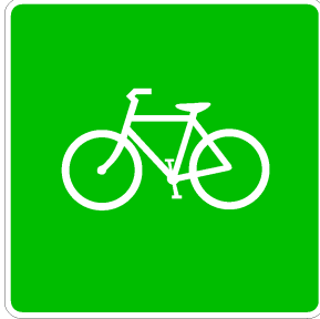
D11-1a 450 x 450 mm (18 x 18 in) min. White symbol & border on green background