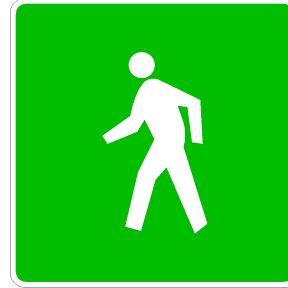
D11-2 450 x 450 mm (18 x 18 in) min. White symbol & border on green background