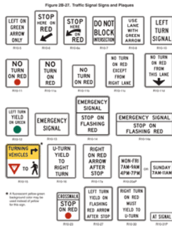
Figure 2B-27 Traffic Signal Signs and Plaques

70 71 72 73 74 75 76 77 78 79 80 81 82 83 84 85 86 87 88 89 90 91 92 93 94 95 96 97 98 99 100 101