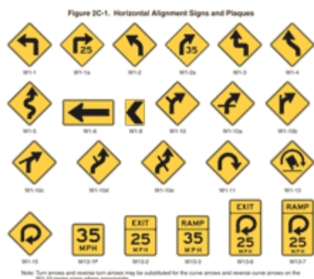
Figure 2C-1 Horizontal Alignment Signs and Plaques

01 A variety of horizontal alignment warning signs (see Figure 2C-1 ), pavement markings (see Chapter 3B), and delineation (see Chapter 3F) can be used to advise motorists of a change in the roadway alignment. Uniform application of these traffic control devices with respect to the amount of change in the roadway alignment conveys a consistent message establishing driver expectancy and promoting effective roadway operations. The design and application of horizontal alignment warning signs to meet those requirements the needs of motorists are addressed in Sections 2C.06 through 2C.15.