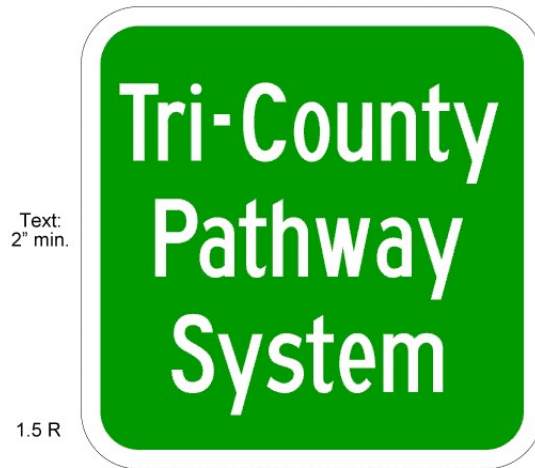
M1-x (word legend) 12" x 12" size (Path)